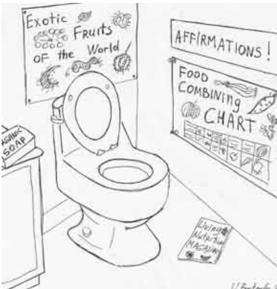
A raw food eater's bathroom