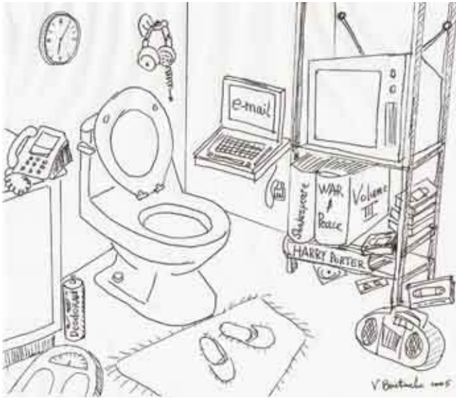
A mainstream eater's bathroom